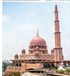
Rich & Diverse Cultures